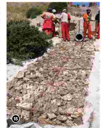
11-15: Drainage repair at Noordhoek Beach