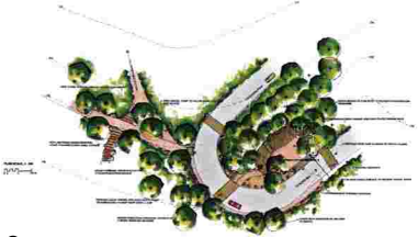
6 Tafelberg Road: S-Bend