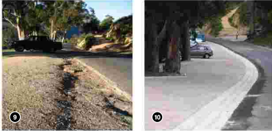
9-10: Lion's Head parking upgrade