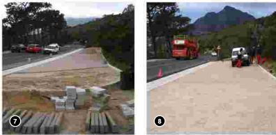
7-8: S-Bend parking upgrade