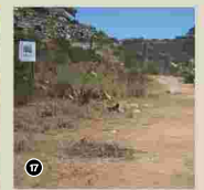
16-17: The site as it looks today